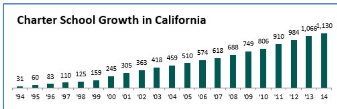
Figure 2. Charter school growth in California. Adapted from California Charter Schools by the Numbers , n.d., by California Charter School Association, retrieved from http://www.ccsa.org/understanding/numbers/ . Copyright 2015 by the authors.

President Clinton proposed a program to provide start-up funds for charter schools. In 1994 as part of the Reauthorized Elementary and Secondary Education Act the program was enacted and now provides start-up funds to charter schools. The law enacting the program required that parent and students have choice among public schools in an effort to promote comprehensive education reform and give more students the opportunity to learn.